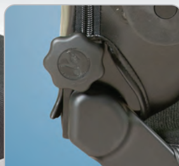
Infinitely Adjustable Lumbar