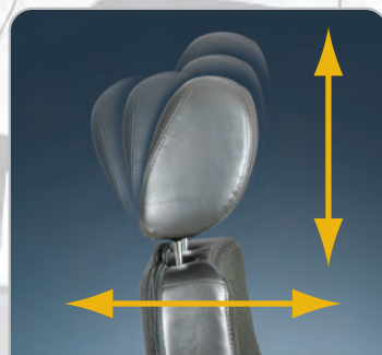
4-Way Adjustable Headrest