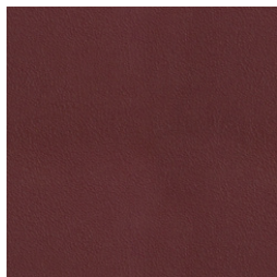
Predictions Claret #62000607