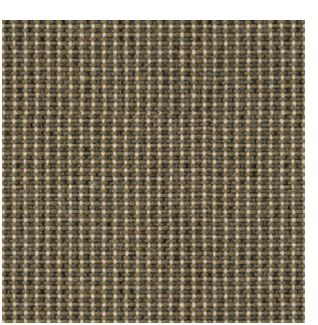
New Sand #61000056