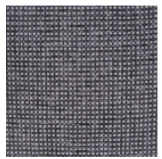
New Charcoal #61000057