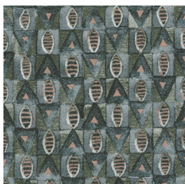
Keops Verde #62000105 Combo #107 w/Docca Beige