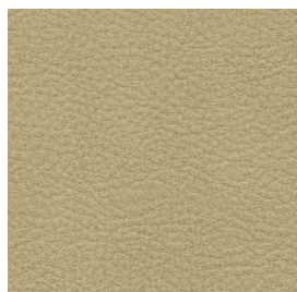
Docca Sand Beige #62000106 Combo #107 w/Keops Verde