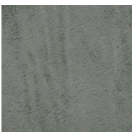
Tropicana Grey #62000103 Combo #104 w/Keops Azul Inserts