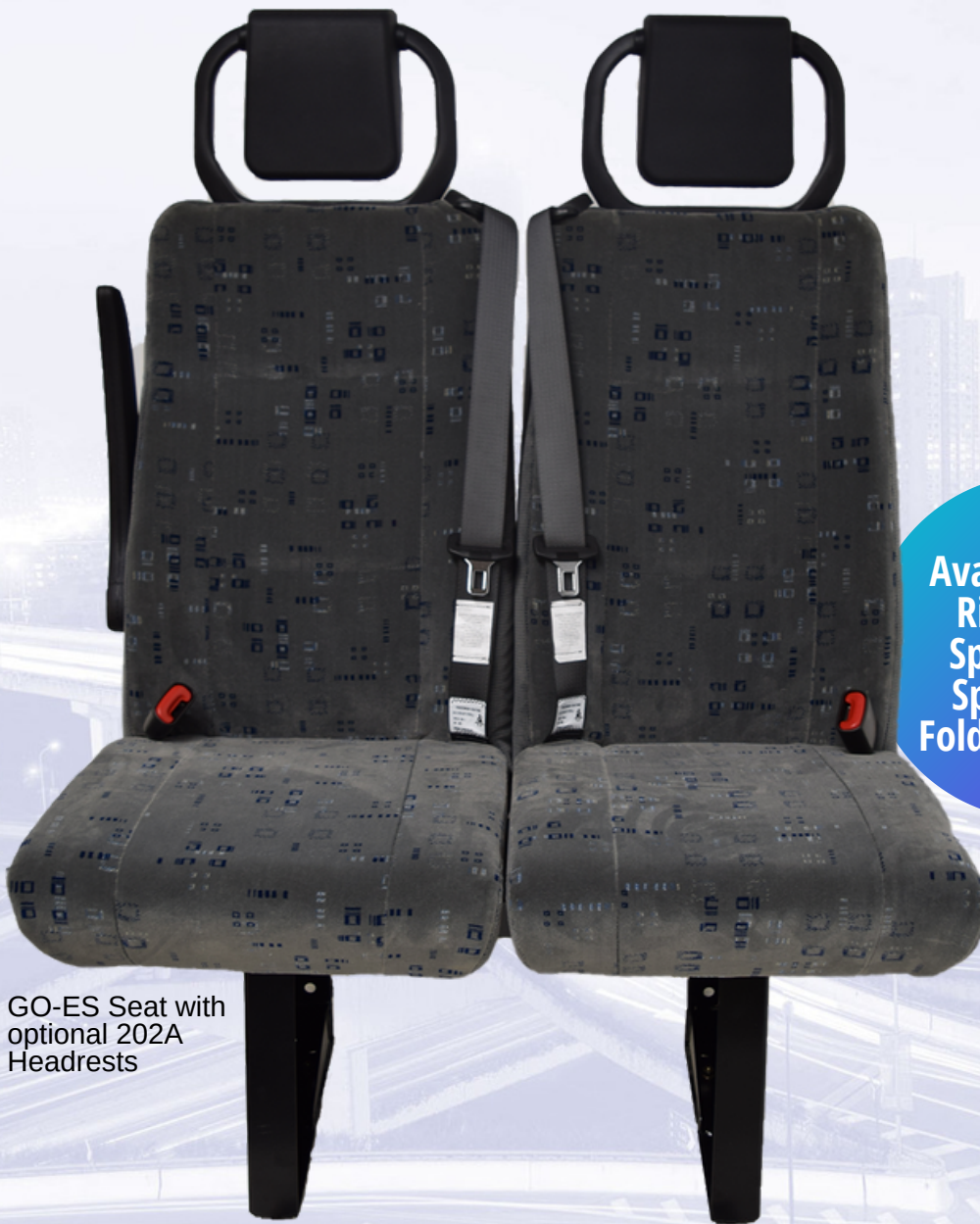
GO-ES Seat with optional 202A Headrests

Available as a Rigid, Flip, SplitFlip, or SpaceSaver Foldaway Seat!