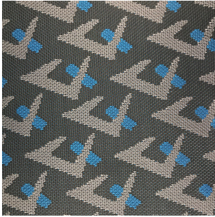
Tumbler #61108082 #040 w/CMI D-90 Blue