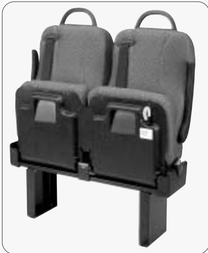
Stowed Position Flip Seat