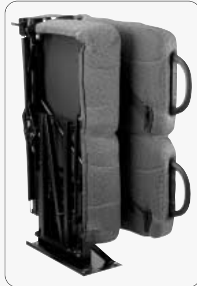
Stowed Position Foldaway Seat