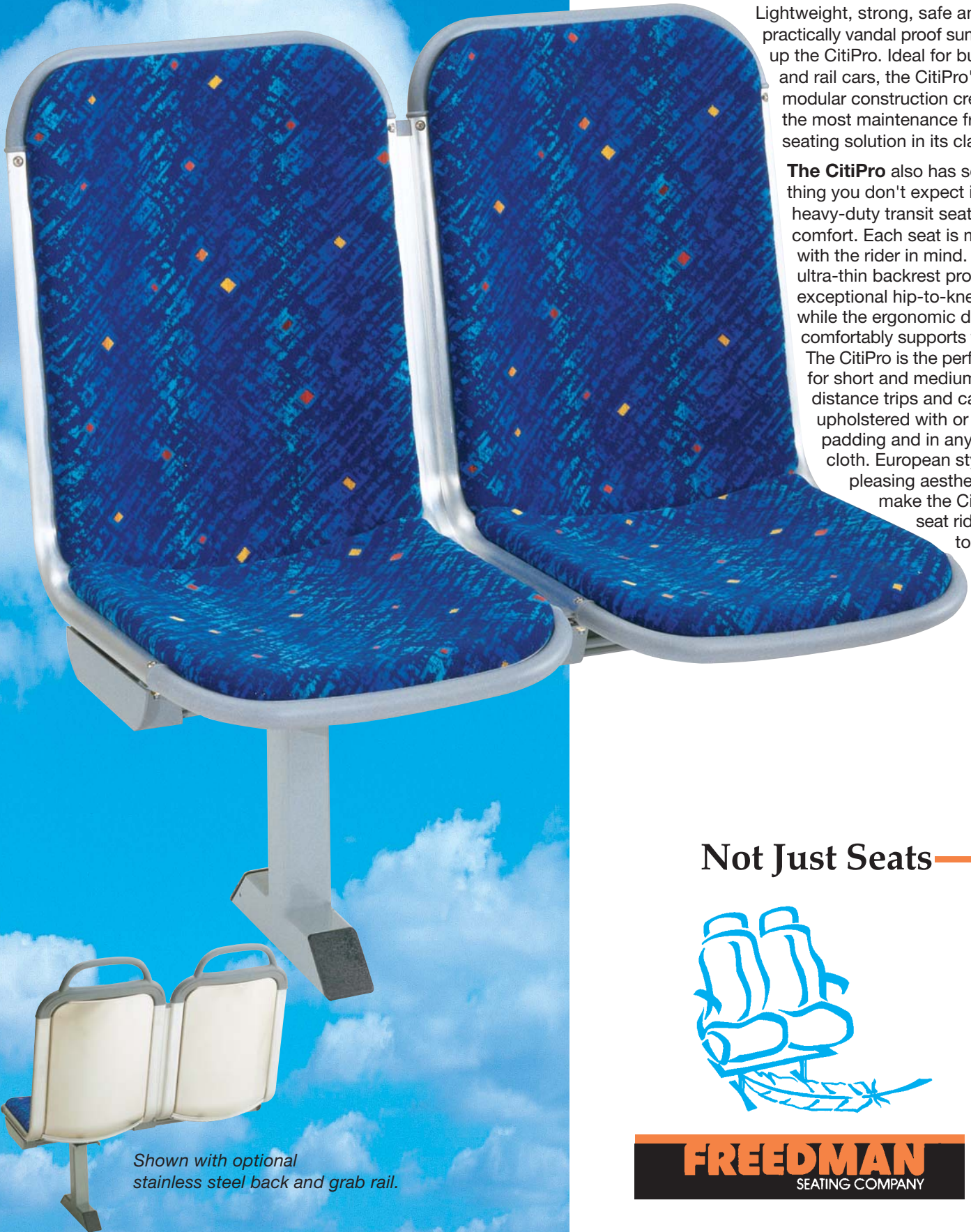
Shown with optional stainless steel back and grab rail.

The CitiPro also has something you don't expect in a heavy-duty transit seat... comfort. Each seat is made with the rider in mind. The ultra-thin backrest provides exceptional hip-to-knee room while the ergonomic design comfortably supports the rider. The CitiPro is the perfect seat for short and medium distance trips and can be upholstered with or without padding and in any vinyl or cloth. European styling and pleasing aesthetics make the CitiPro a seat riders want to sit in.