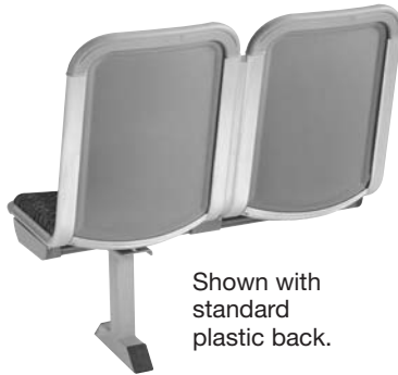
Shown with standard plastic back.